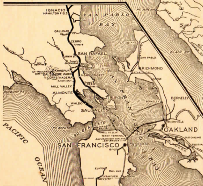
SAUSALITO AND ADJACENT TERRITORY SCALE IN MILES