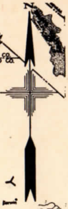
J.E.M. SCALE OF MILES 0 5 10 20 30 40