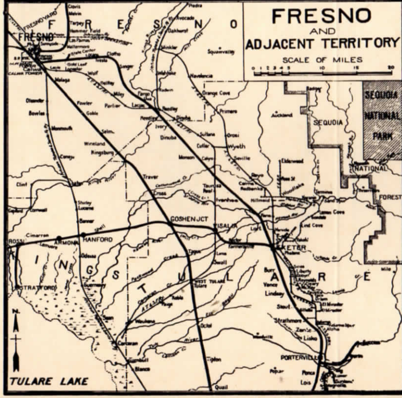
FRESNO AND ADJACENT TERRITORY SCALE OF MILES 0 5 10 15 20