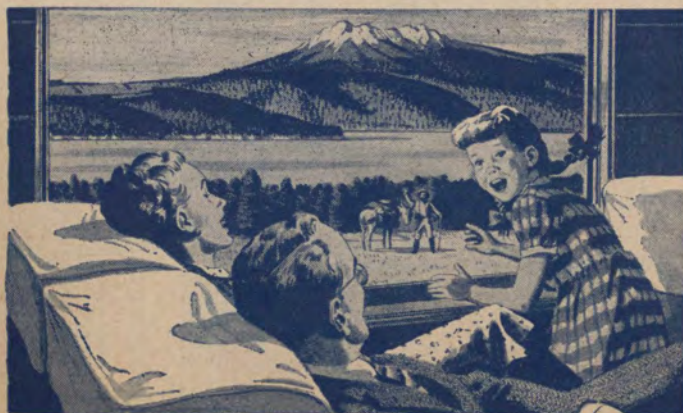
See the High Sierra, Overland Route

ON SOUTHERN PACIFIC'S FOUR SCENIC ROUTES YOU CAN GO ONE WAY, RETURN ANOTHER—SEE TWICE AS MUCH!