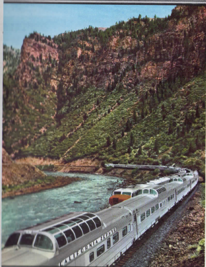
California Zephyr—Glenwood Canyon, Colorado River