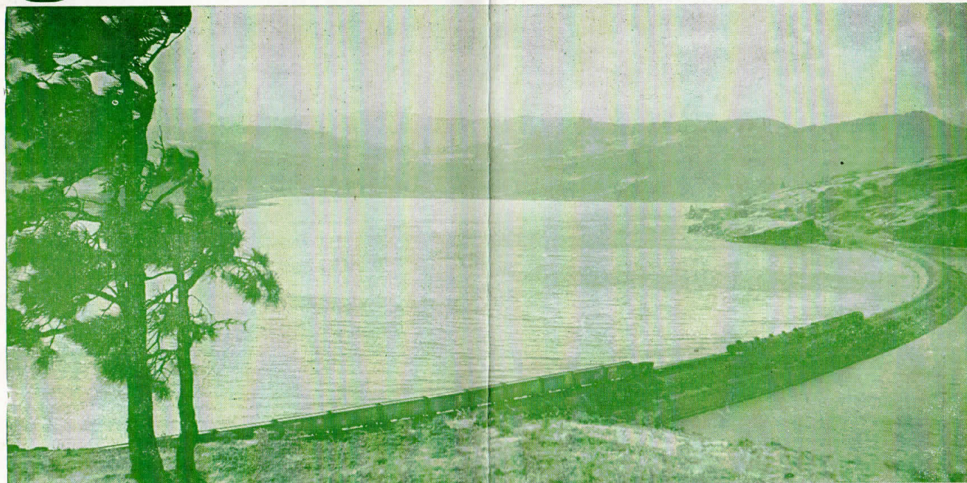
S. P. & S. Ry. Near Bingen-White Salmon, Washington

S. P. & S. RY. - OREGON TRUNK RY. - OREGON ELECTRIC RY. - (Subsidiaries of Northern Pacific and Great Northern Railways)