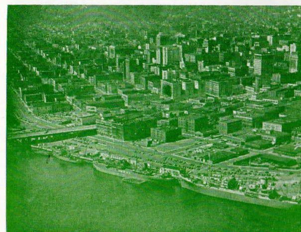
Portland - the Rose City

Your Choice of . . . Two Daily Trains Between PORTLAND and SPOKANE