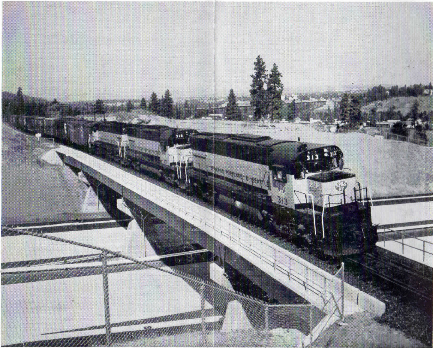
Spokane, Portland & Seattle Railway with Spokane, Washington in the background.