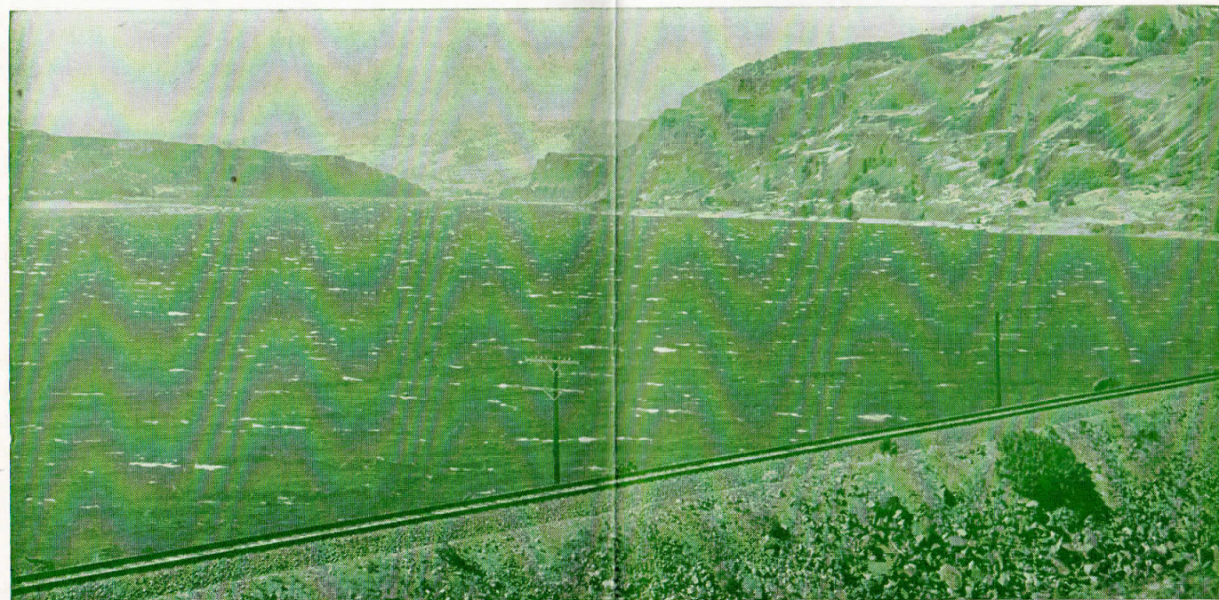
S. P. & S. Ry. Along The Columbia River Near Lyle, Washington