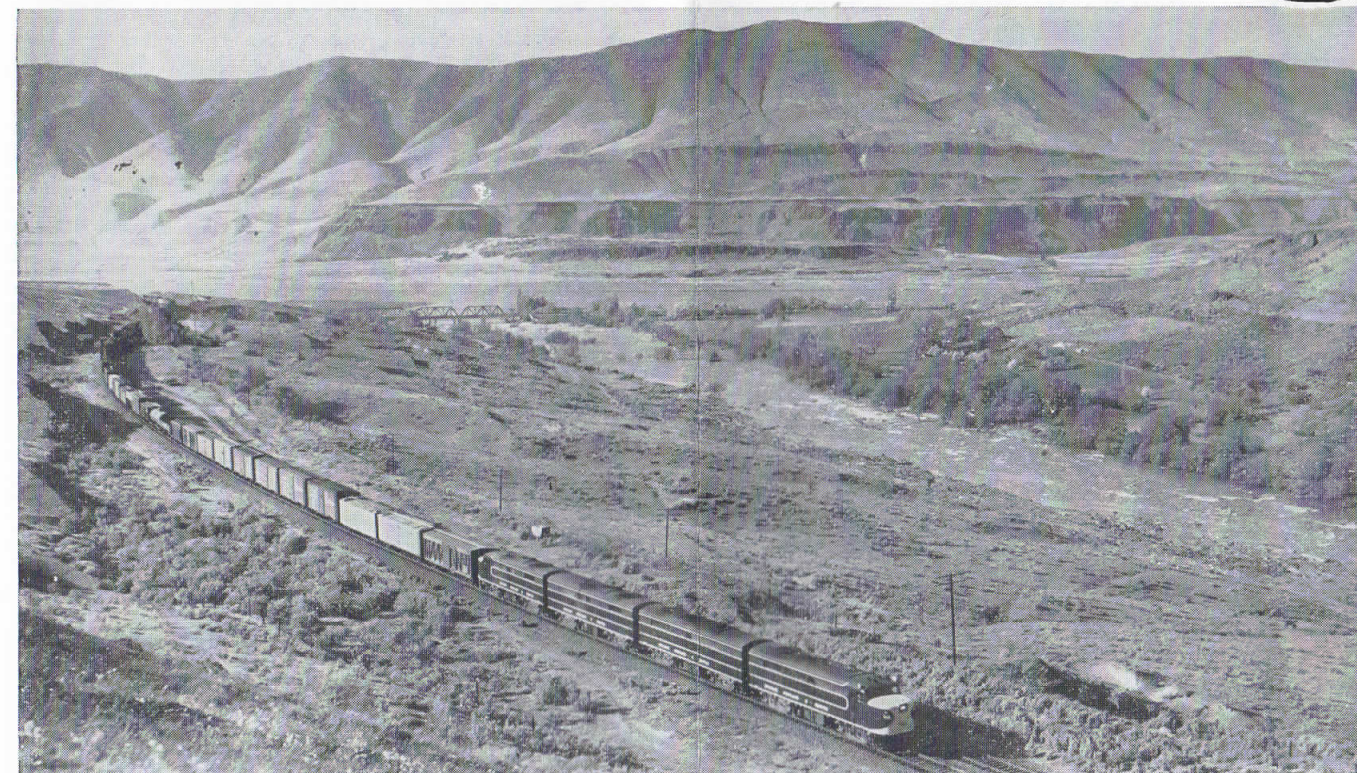
Oregon Trunk Ry. Near Moody, Oregon

S. P. & S. RY. — OREGON TRUNK RY. — OREGON ELECTRIC RY. — (Subsidiaries of Northern Pacific and Great Northern Railways)