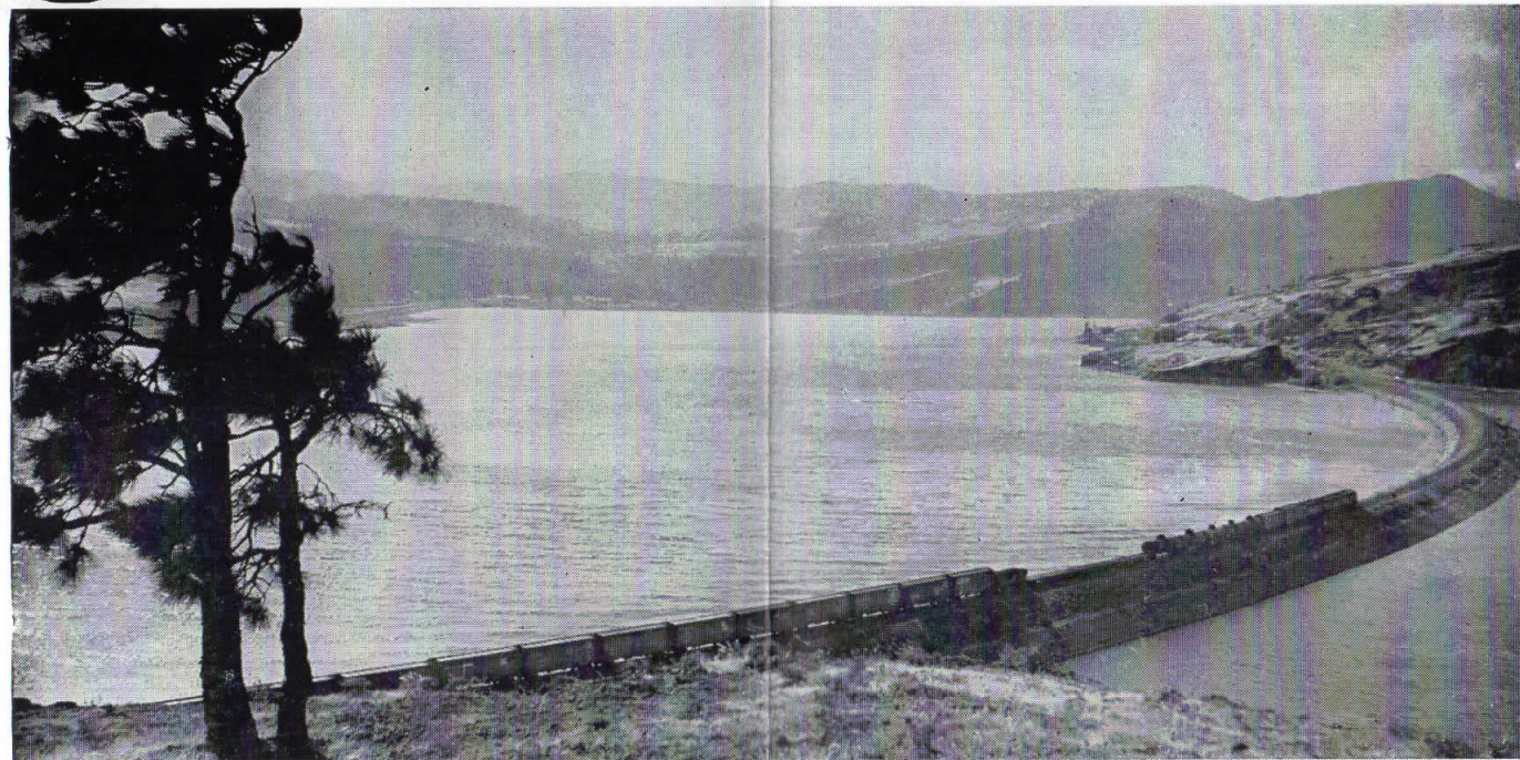
S. P. & S. Ry. Near Bingen-White Salmon, Washington

S. P. & S. RY. — OREGON TRUNK RY. — OREGON ELECTRIC RY. — (Subsidiaries of Northern Pacific and Great Northern Railways)