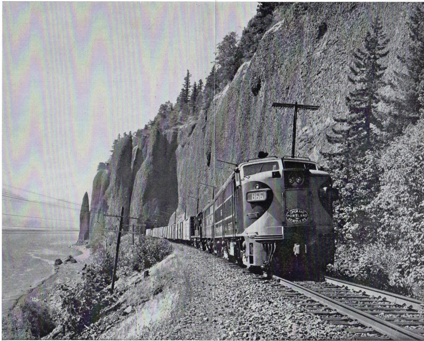
Cape Horn on the Columbia River