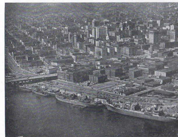
Portland — the Rose City

Your Choice of... Two Daily Trains Between PORTLAND and SPOKANE