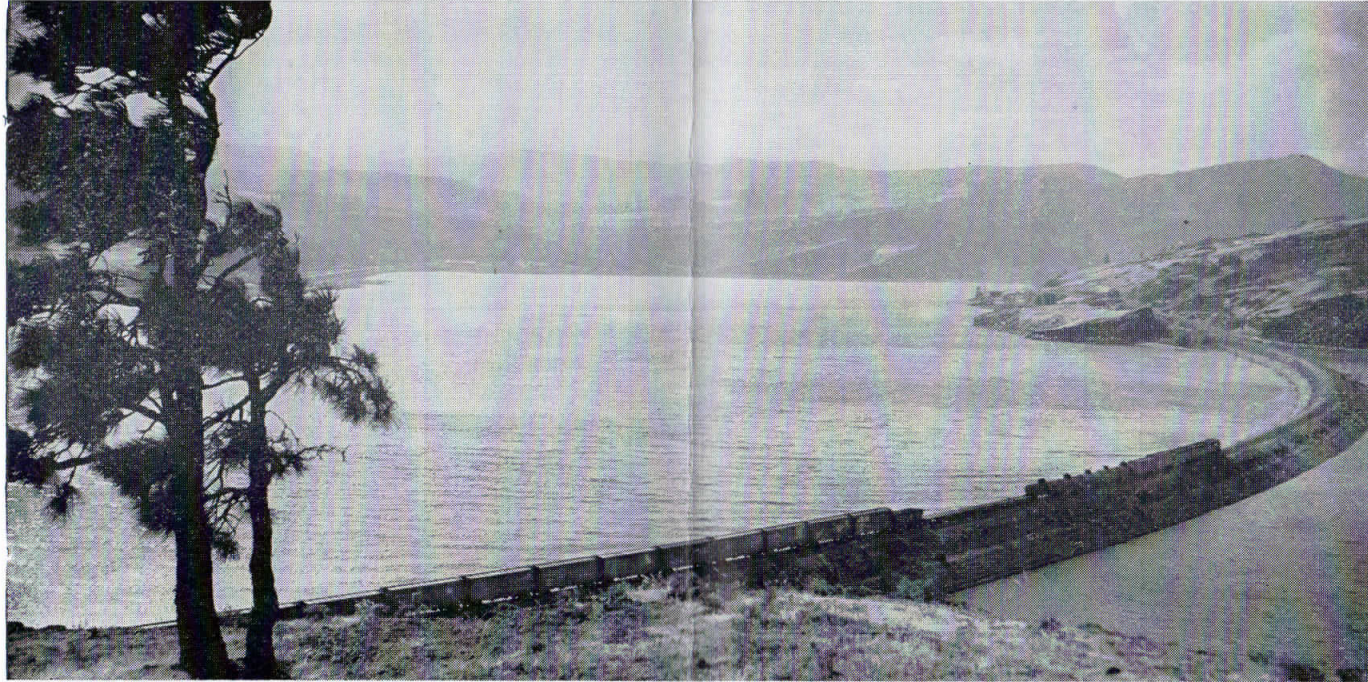
S. P. & S. Ry. Near Bingen-White Salmon, Washington

S. P. & S. RY.—OREGON TRUNK RY.—OREGON ELECTRIC RY.—(Subsidiaries of Northern Pacific and Great Northern Railways)