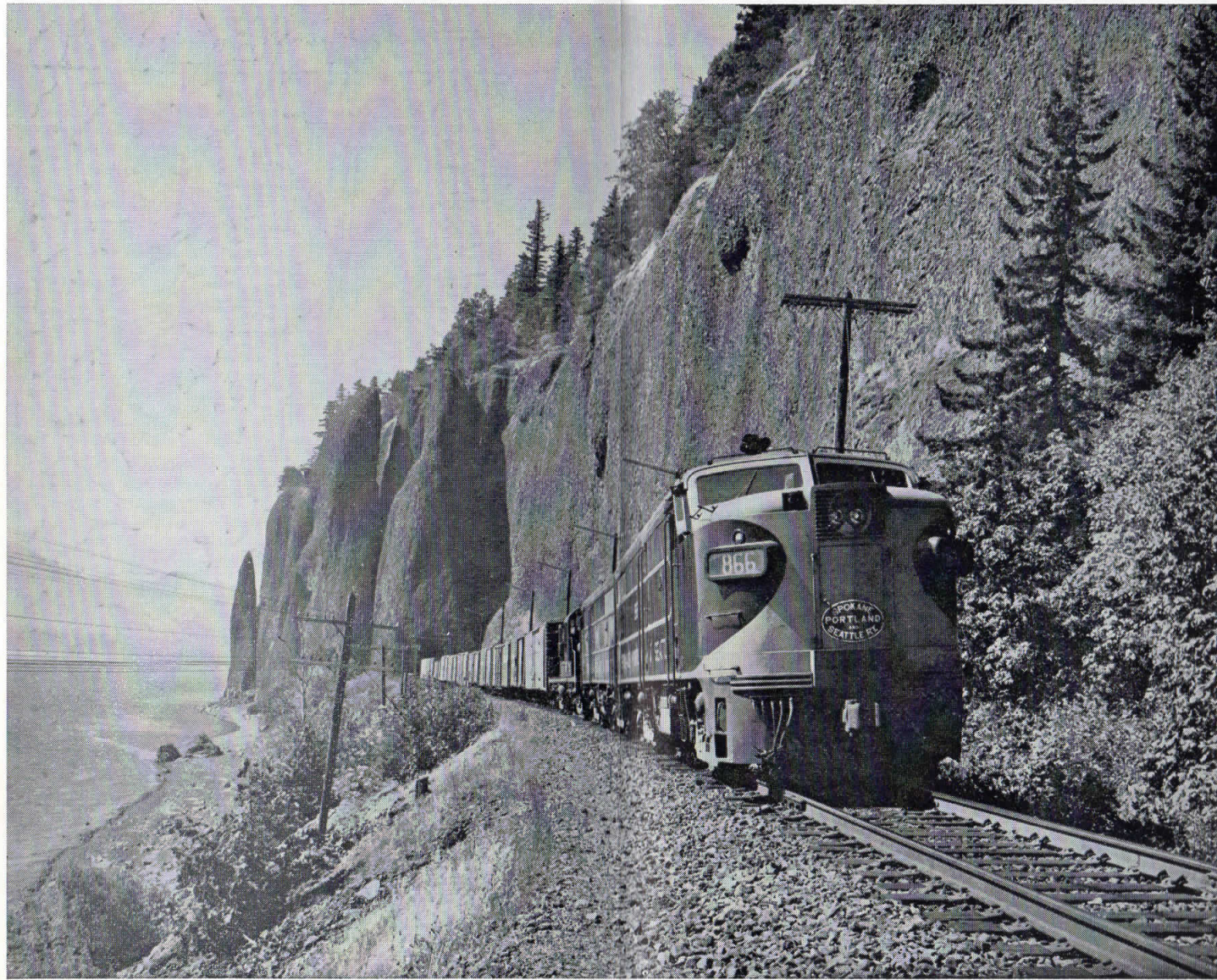
Cape Horn on the Columbia River