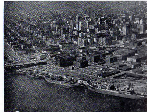
Portland—the Rose City

Your Choice of... Two Daily Trains Between PORTLAND and SPOKANE