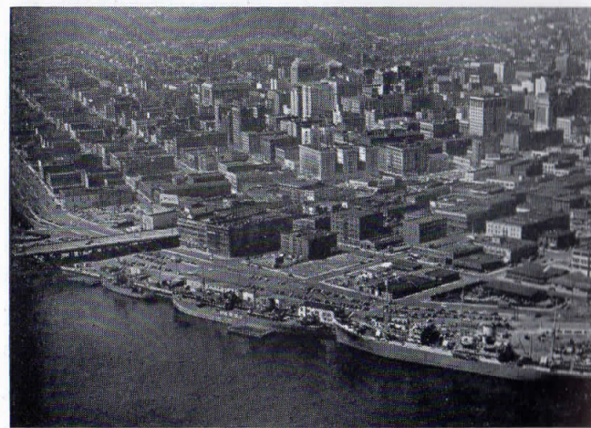
Portland - the Rose City

Your Choice of ... Two Daily Trains Between PORTLAND and SPOKANE