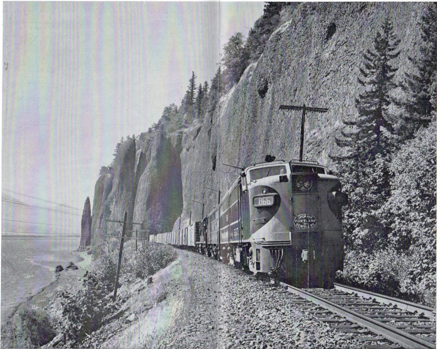
Cape Horn on the Columbia River