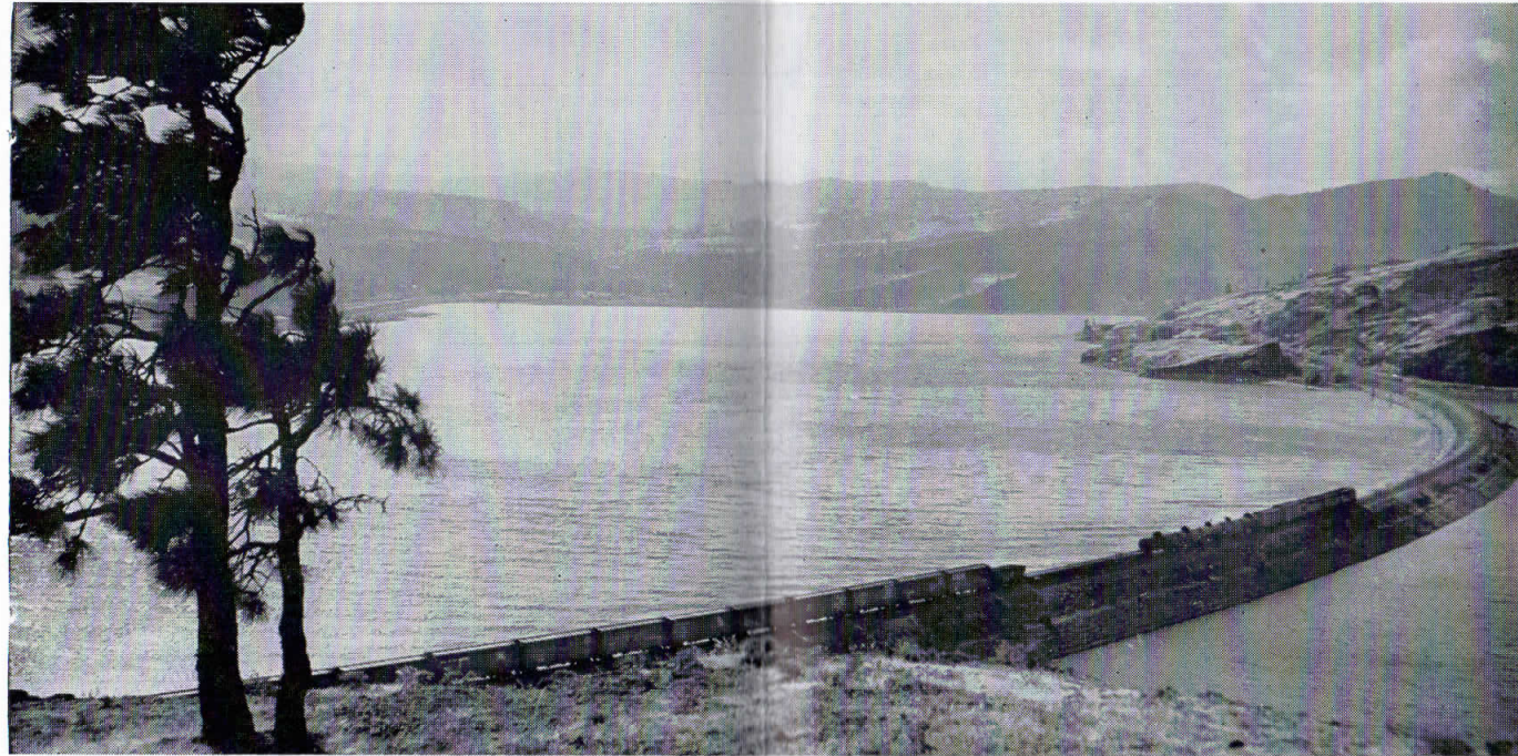
S. P. & S. Ry. Near Bingen-White Salmon, Washington

S. P. & S. RY. - OREGON TRUNK RY. - OREGON ELECTRIC RY. - (Subsidiaries of Northern Pacific and Great Northern Railways)