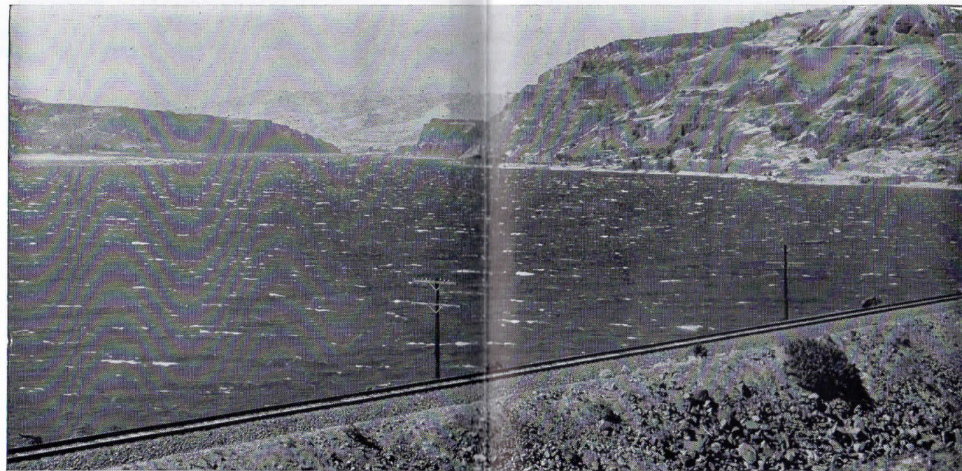
S. P. & S. Ry. Along The Columbia River Near Lyle, Washington