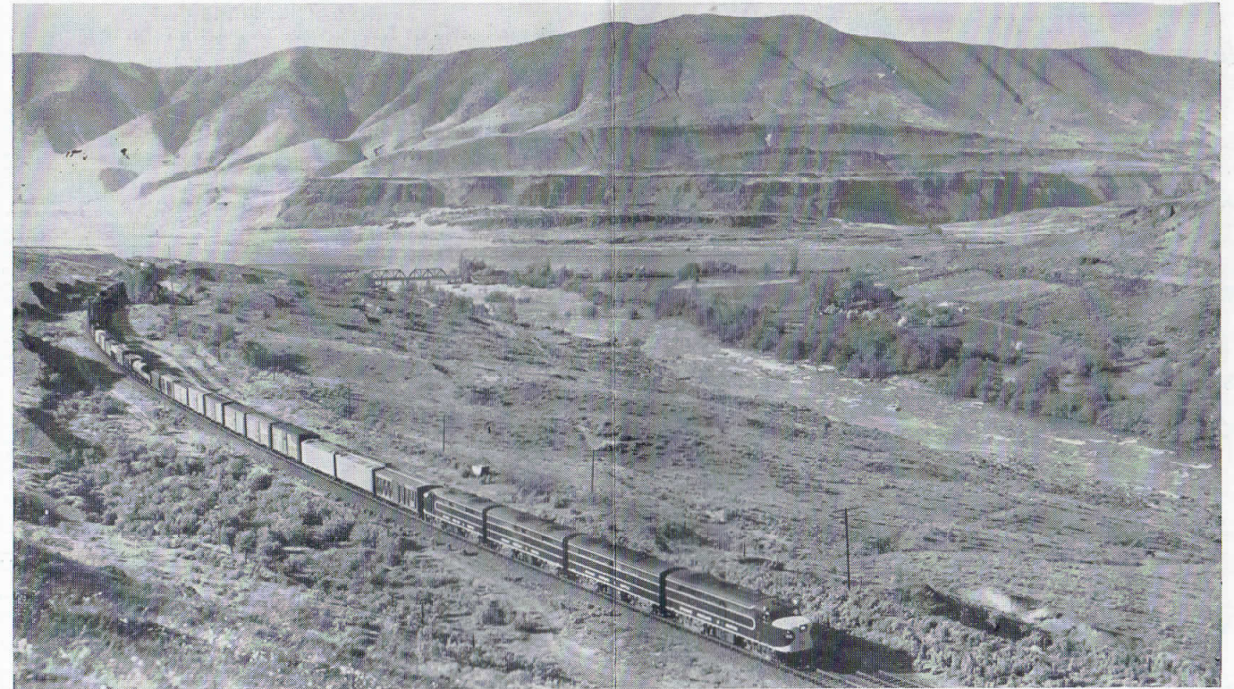
Oregon Trunk Ry. Near Moody, Oregon

S. P. & S. RY. — OREGON TRUNK RY. — OREGON ELECTRIC RY. — (Subsidiaries of Northern Pacific and Great Northern Railways)