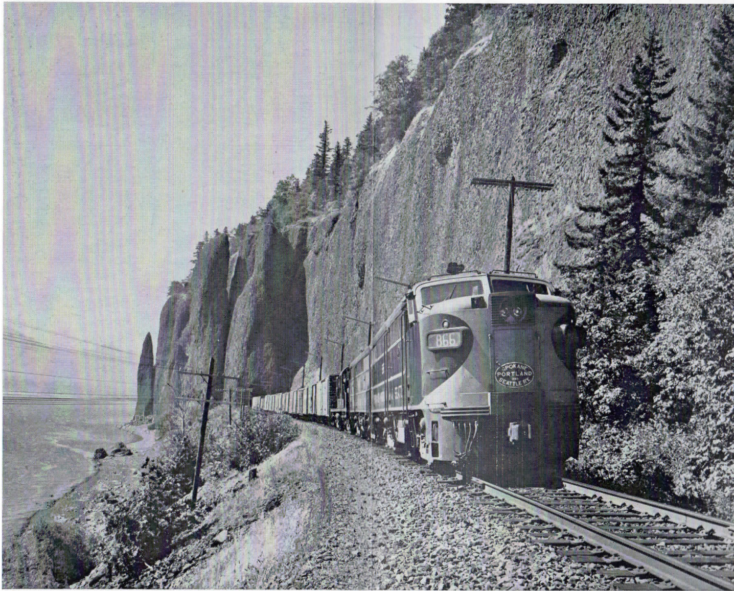
Cape Horn on the Columbia River