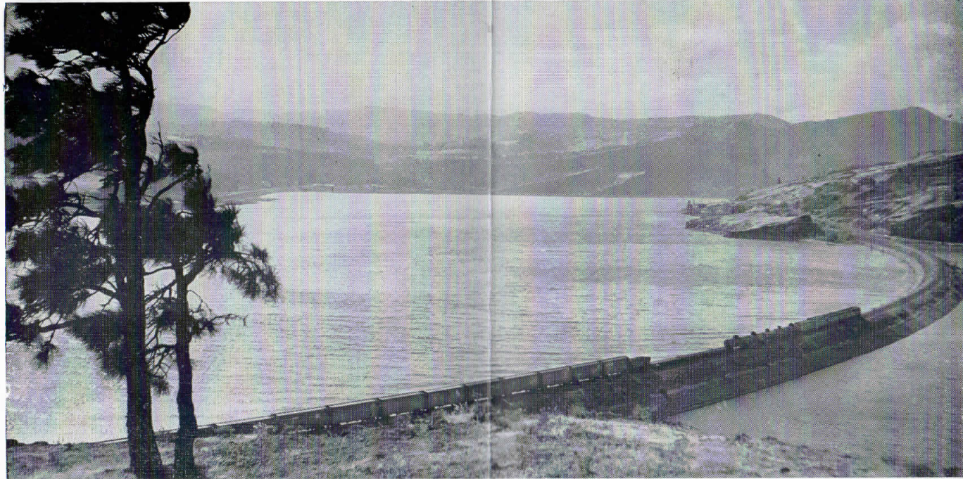
S. P. & S. Ry. Near Bingen-White Salmon, Washington

S. P. & S. RY. — OREGON TRUNK RY. — OREGON ELECTRIC RY. — (Subsidiaries of Northern Pacific and Great Northern Railways)