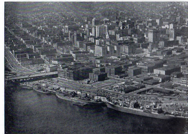
Portland — the Rose City

Your Choice of... Two Daily Trains Between PORTLAND and SPOKANE