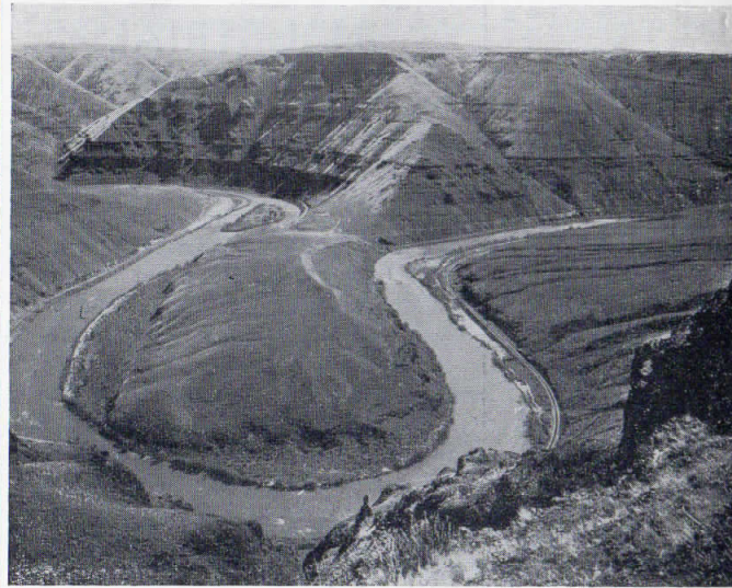
Horseshoe curve near Sinamox on the Oregon Trunk Railway

S. P. & S. RY. - OREGON TRUNK RY. - OREGON ELECTRIC RY. - (Subsidiaries of Northern Pacific and Great Northern Railways)