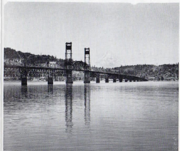
Toll Bridge over the Columbia River near Bingen-White Salmon on the S. P. & S. Ry. with Mt. Hood in the background.