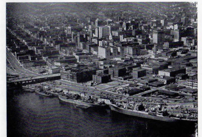
Portland - the Rose City

Vital Link Between SPOKANE, PORTLAND & CALIFORNIA Portland, Pasco, Spokane and East