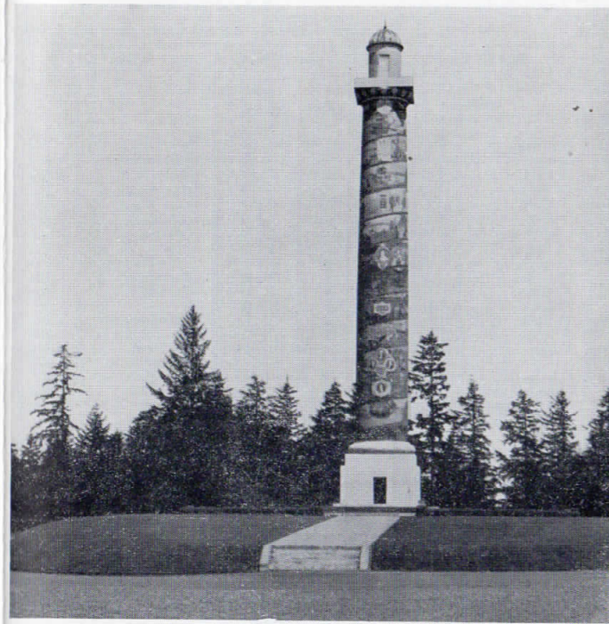
Astor Column, Astoria, Oregon