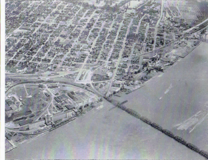
Airplane view of Vancouver, Washington and S. P. & S. bridge across Columbia River