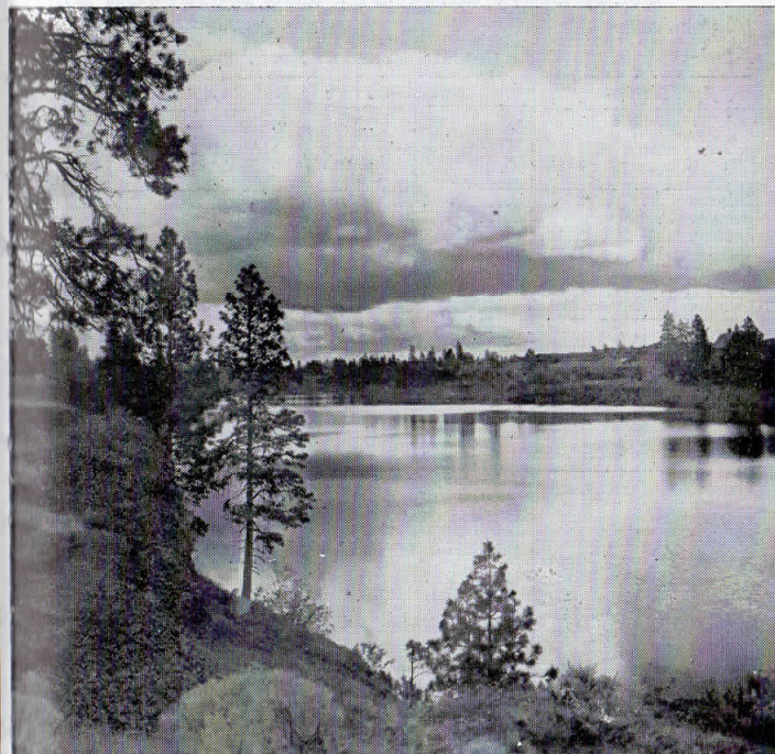
Amber Lake—thirty miles west of Spokane on S.P. & S.Ry. main line.