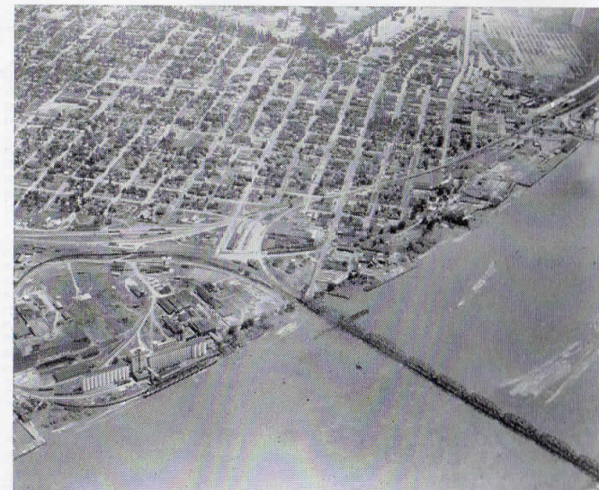
Airplane view of Vancouver, Washington and S. P. & S. bridge across Columbia River

S. P. & S. RY. — OREGON TRUNK RY. — OREGON ELECTRIC RY. — (Subsidiaries of Northern Pacific and Great Northern Railways)