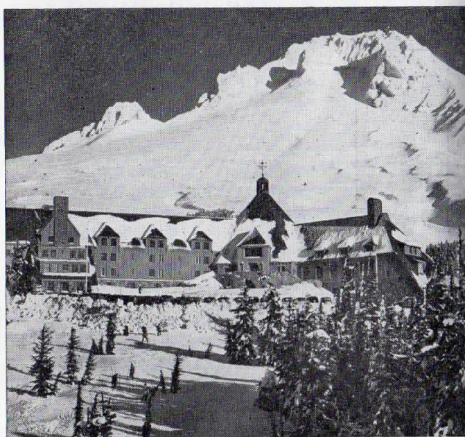
Mt. Hood (11,245 ft.) and Timberline Lodge at the 6000 foot level. Reached by short motor trip or by sight seeing buses from Portland, Oregon. Ski-lift showing above center of lodge extends one mile to 7000 foot level.

S. P. & S. RY. — OREGON TRUNK RY. — OREGON ELECTRIC RY. — (Subsidiaries of Northern Pacific and Great Northern Railways)