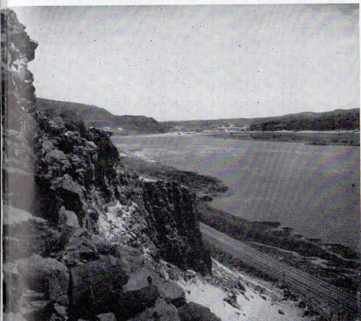
Columbia River—near Wishram, Wash. on S.P. & S.Ry. main line.

Your Choice of... Three Daily Trains Between PORTLAND and SPOKANE