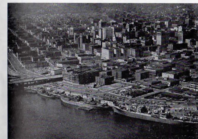
Portland — the Rose City