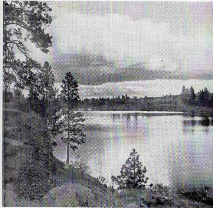
Amber Lake—thirty miles west of Spokane on S.P. & S.Ry. main line.