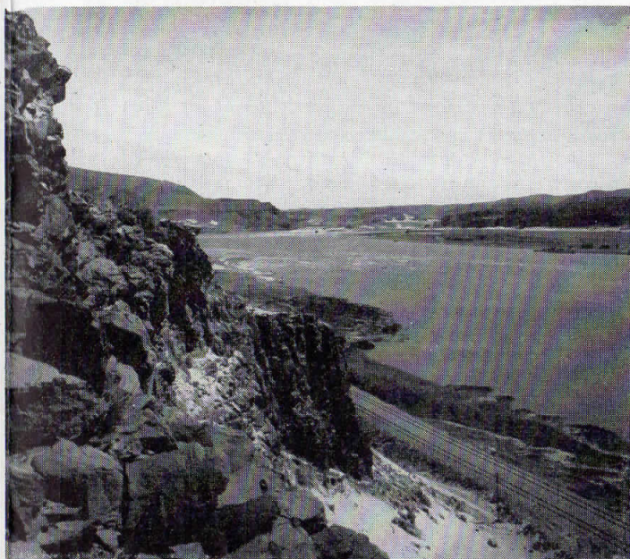
Columbia River—near Wishram, Wash. on S.P. & S.Ry. main line.