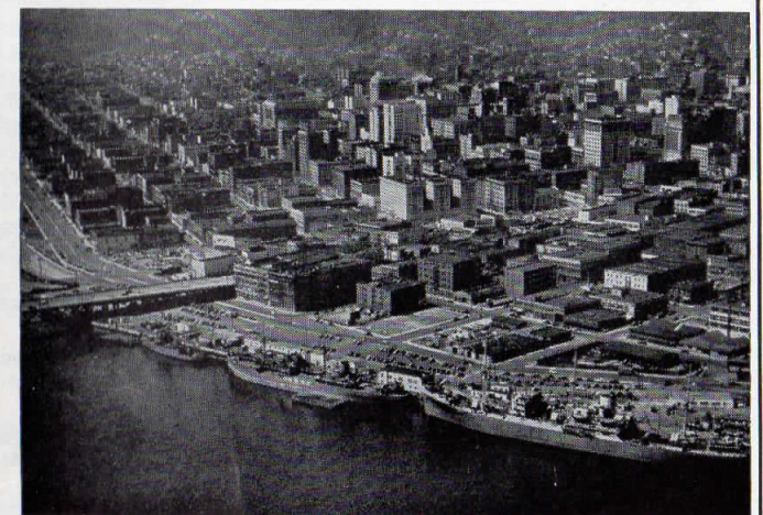
Portland—the Rose City