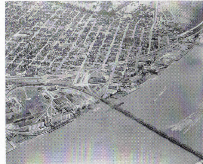
Airplane view of Vancouver, Washington and S.P. & S. bridge across Columbia River