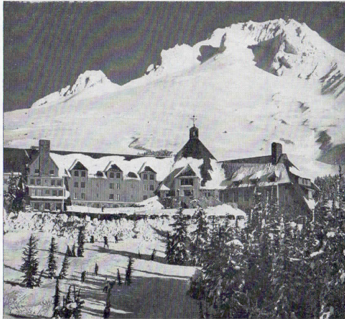
Mt. Hood (11,245 ft.) and Timberline Lodge at the 6000 foot level. Reached by short motor trip or by sight seeing buses from Portland, Oregon. Ski-lift showing above center of lodge extends one mile to 7000 foot level.

S. P. & S. RY.—OREGON TRUNK RY.—OREGON ELECTRIC RY.—(Subsidiaries of Northern Pacific and Great Northern Railways)