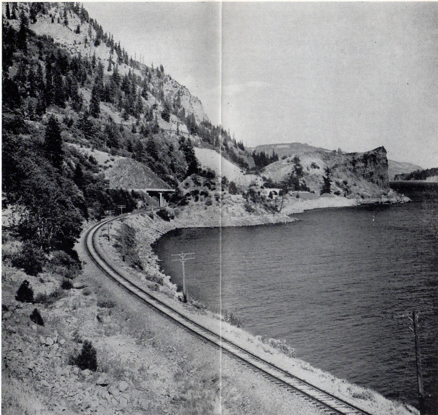
Columbia River Scene Near Hood, Washington, 71 Miles East of Portland on the Spokane, Portland and Seattle Ry.