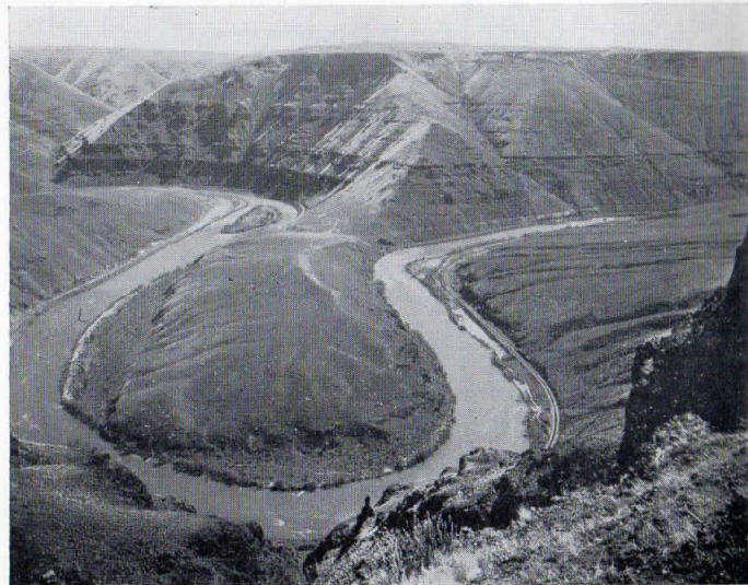
The Horseshoe Curve Near Sinamox, Ore., Oregon Trunk Ry.