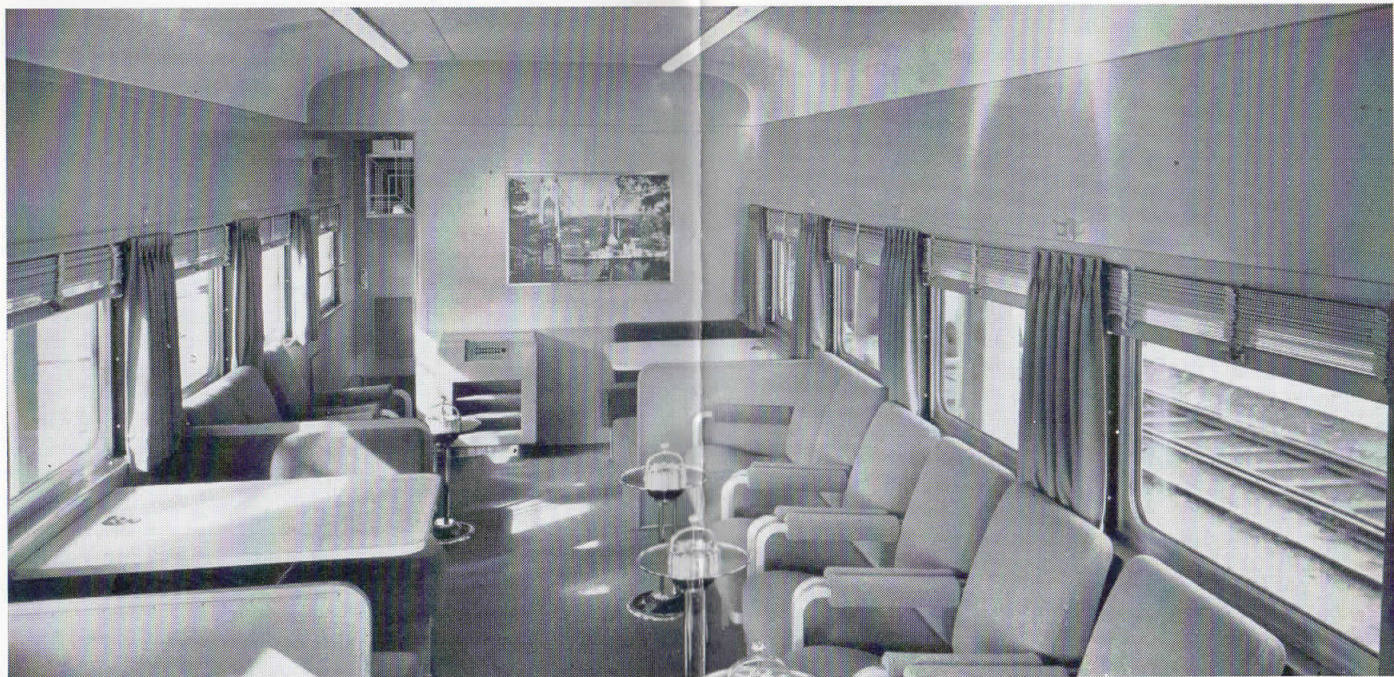
Interior view new S. P. & S. Sleeper-Club-Lounge Car operating in Train 1 and 2 Streamliners between Portland and Spokane.

S. P. & S. RY.—OREGON TRUNK RY.—OREGON ELECTRIC RY.—(Subsidiaries of Northern Pacific and Great Northern Railways)