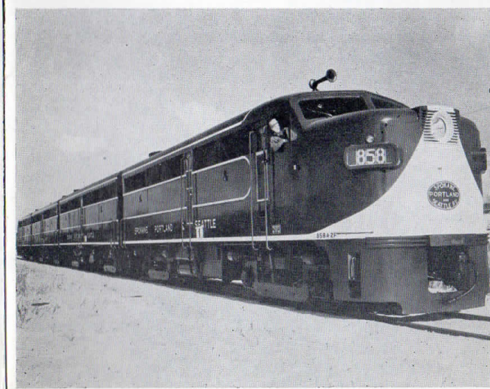
New 4 Unit 6000 H.P. Diesel Electric Locomotive Used in Fast Freight Service Between Portland, Pasco, Spokane and Bend.