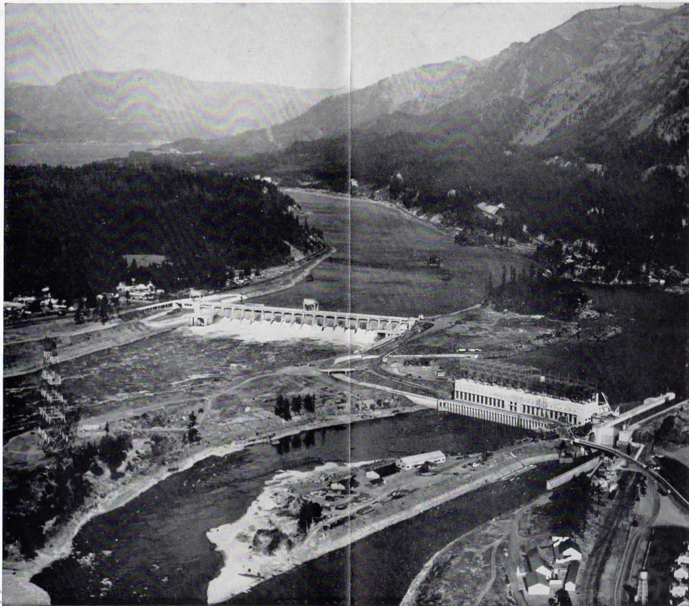
Bonneville Dam, adjacent to North Bonneville, Washington, 49 miles east of Portland, Oregon on the main line of the Spokane, Portland and Seattle Railway.

This dam, which is one of the government's greatest power-navigation projects, was built at a cost exceeding $81,386,000.00. A wonderful view of this great work of engineering and the surrounding mountains ranging in altitude from 2,000 to 5,000 feet, may be seen from the trains of the S. P. & S. Railway.