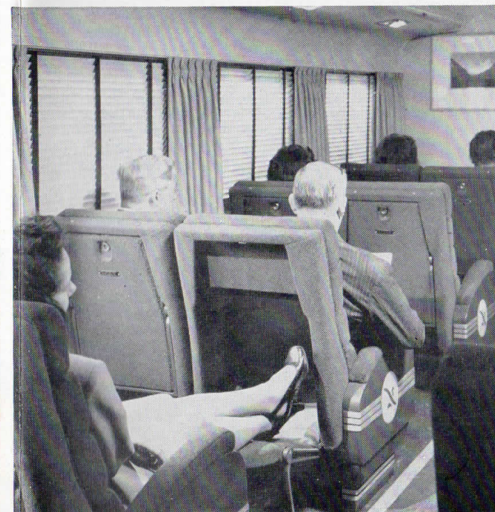
A leg rest adds to the travel ease of coach passengers on the Empire Builder, new S. P. & S.-G. N. streamlined train.