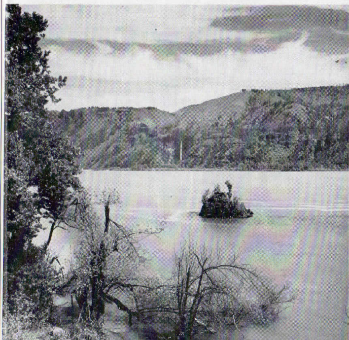
Multnomah Falls and Columbia River, East of Portland, Oregon, seen from S. P. & S. Railway Trains.