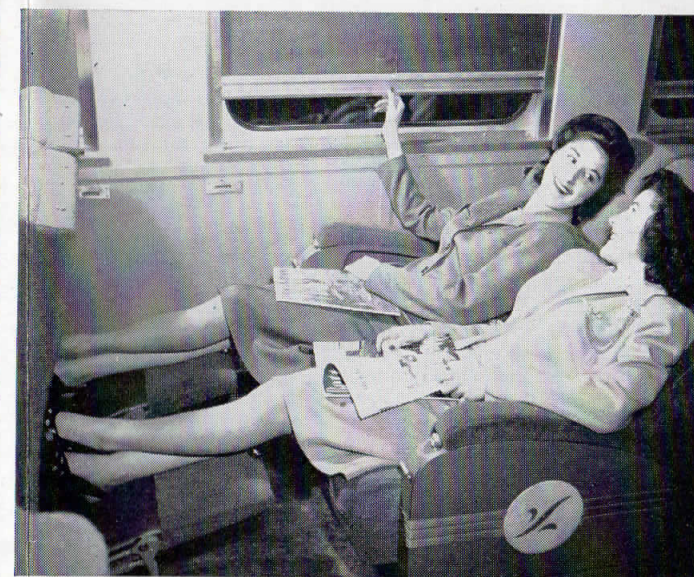
28 passengers can be accommodated in the coach section of the new buffet-lounge coach and 48 passengers in the other post-war coaches now in service on the S. P. & S.-N. P. Streamlined North Coast Limited. These are the comfortable "Sleepy Hollow" seats with leg rest for reclining position.