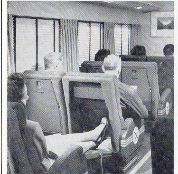
A leg rest adds to the travel ease of coach passengers on the Empire Builder, new S. P. & S.-G. N. streamlined train.