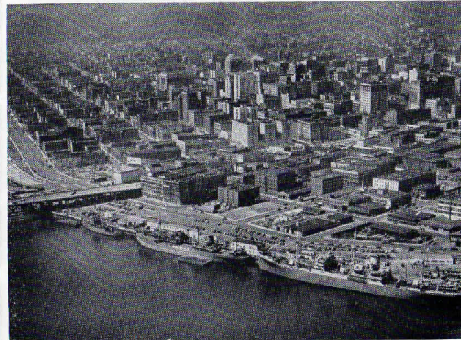
Portland—the Rose City