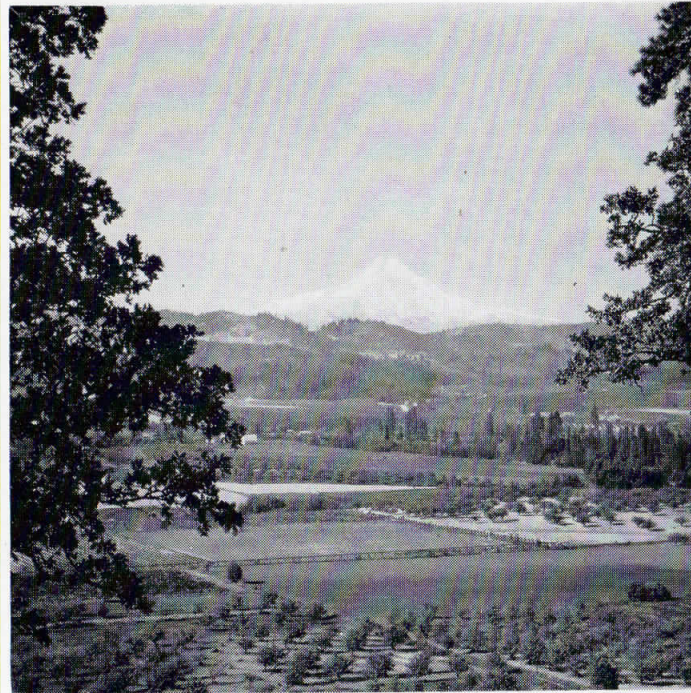
"Mt. Hood, Oregon" seen from S. P. & S. Railway Co. trains.

S. P. & S. RY.—OREGON TRUNK RY.—OREGON ELECTRIC RY.—(Subsidiaries of Northern Pacific and Great Northern Railways)