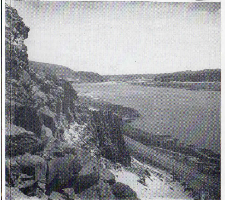
"Columbia River" near Wishram, Washington on line of S. P. & S. Railway.