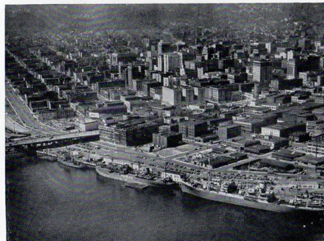
Portland—the Rose City