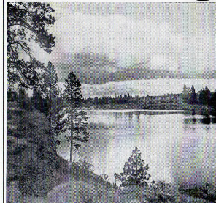
"Amber Lake," seen from S. P. & S. Ry. Co. Trains.