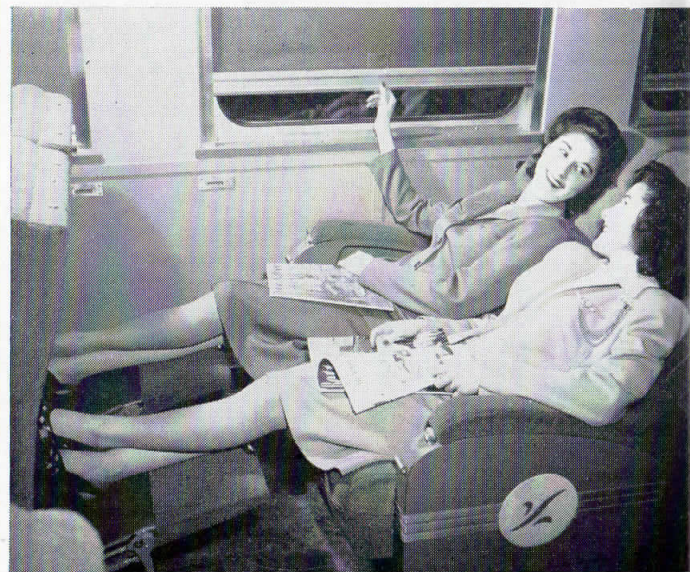
28 passengers can be accommodated in the coach section of the new buffet-lounge coach and 48 passengers in the other post-war coaches now in service on the S. P. & S.-N. P. North Coast Limited. These are the comfortable "Sleepy Hollow" seats with leg rest for reclining position.