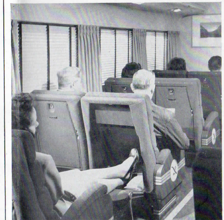
A leg rest adds to the travel ease of coach passengers on the Empire Builder, new S. P. & S.-G. N. streamlined train.