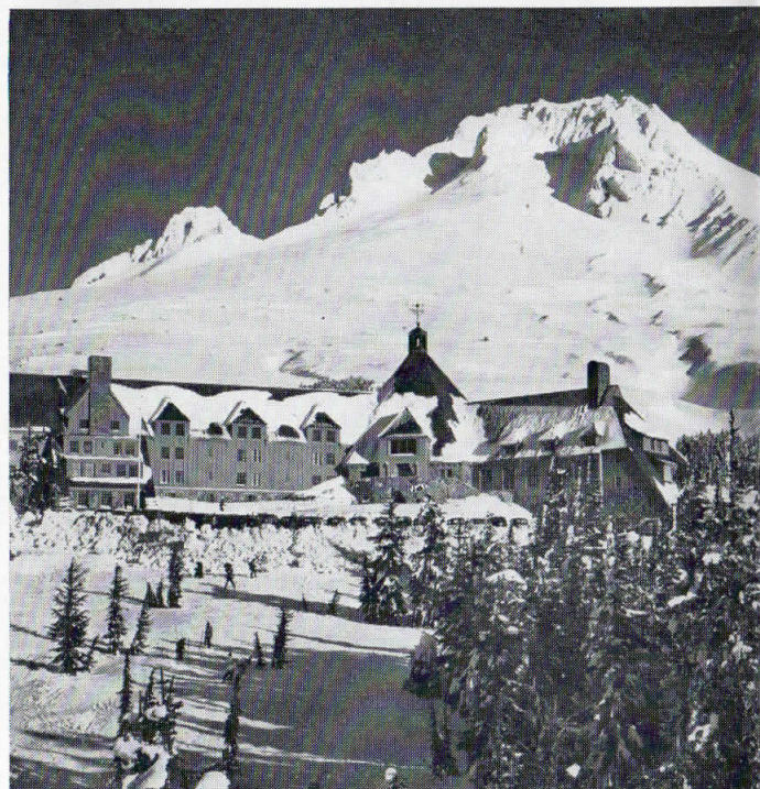
"Timberline Lodge", Mt. Hood, Oregon. Reached by short motor trip or by sight-seeing busses from Portland.

S. P. & S. RY.—OREGON TRUNK RY.—OREGON ELECTRIC RY.—(Subsidiaries of Northern Pacific and Great Northern Railways)