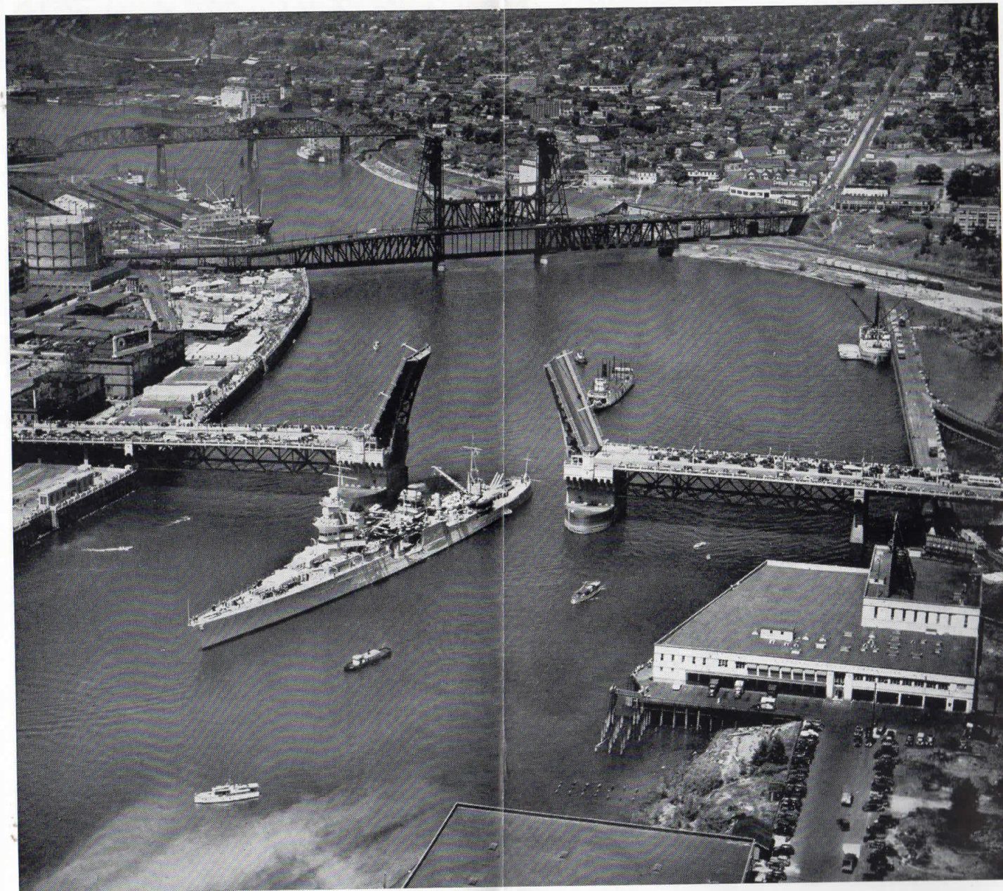
Cruiser U S S Indianapolis passing through Burnside Bridge (Willamette River) Portland, Oregon