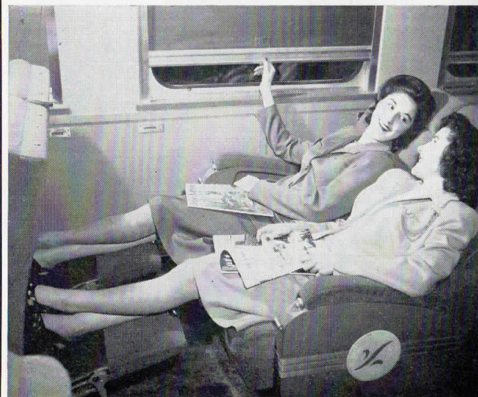
28 passengers can be accommodated in the coach section of the new buffet-lounge coach and 48 passengers in the other post-war coaches now in service on the S. P. & S.-N. P. North Coast Limited. These are the comfortable "Sleepy Hollow" seats with leg rest for reclining position.