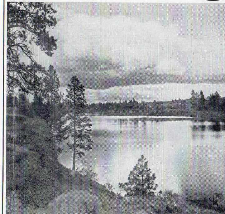
"Amber Lake," seen from S. P. & S. Ry. Co. Trains.

Ask agent or representative for further details on any of the above arrangements.