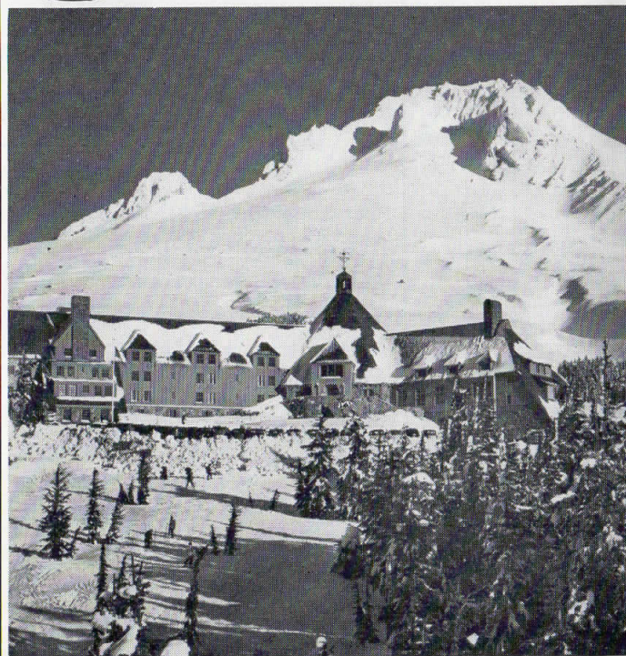
"Timberline Lodge", Mt. Hood, Oregon. Reached by short motor trip or by sight-seeing busses from Portland.

S. P. & S. RY.—OREGON TRUNK RY.—OREGON ELECTRIC RY.—(Subsidiaries of Northern Pacific and Great Northern Railways)