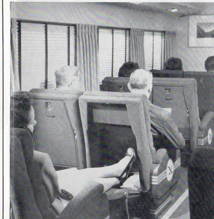
A leg rest adds to the travel ease of coach passengers on the Empire Builder, new S. P. & S.-G. N. streamlined train.