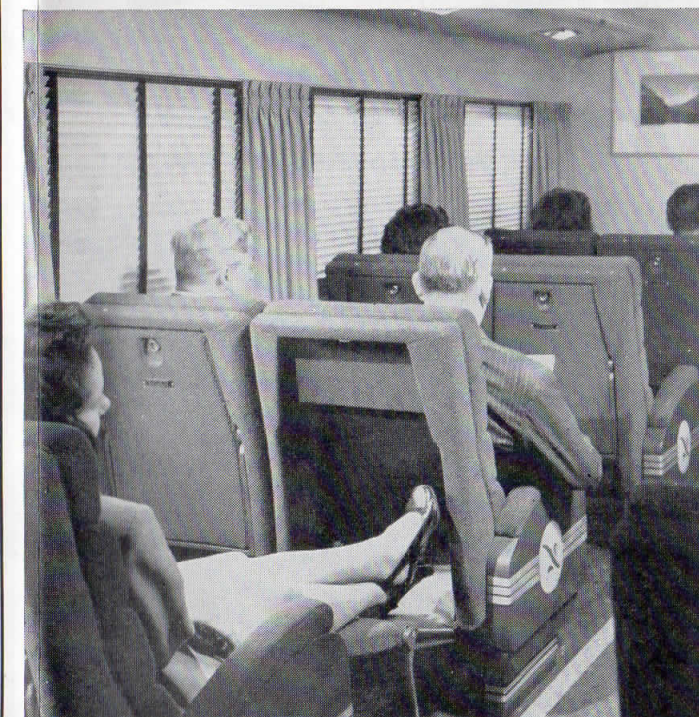
A leg rest adds to the travel ease of coach passengers on the Empire Builder, new S. P. & S.-G. N. streamlined train.