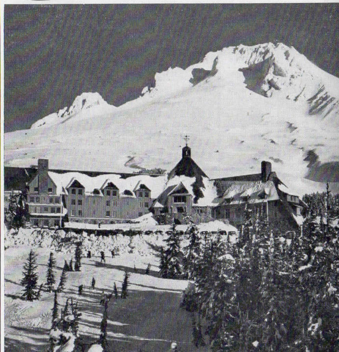
"Timberline Lodge", Mt. Hood, Oregon. Reached by short motor trip or by sight-seeing busses from Portland.

S. P. & S. RY.—OREGON TRUNK RY.—OREGON ELECTRIC RY.—(Subsidiaries of Northern Pacific and Great Northern Railways)