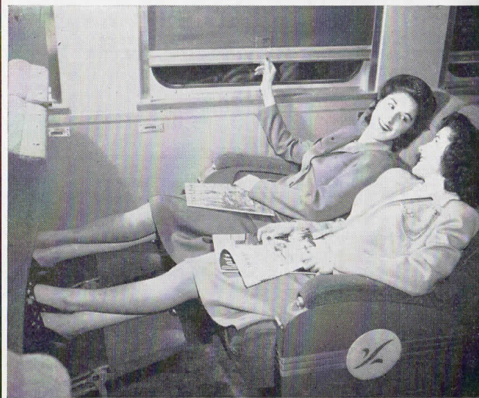
28 passengers can be accommodated in the coach section of the new buffet-lounge coach and 48 passengers in the other post-war coaches now in service on the S. P. & S.-N. P. North Coast Limited. These are the comfortable "Sleepy Hollow" seats with leg rest for reclining position.