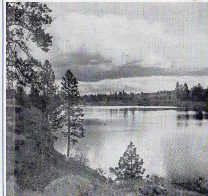
"Amber Lake," seen from S. P. & S. Ry. Co. Trains.

Ask agent or representative for further details on any of the above arrangements.