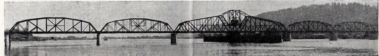
S. P. & S. RAILWAY BRIDGE ACROSS WILLAMETTE RIVER, PORTLAND, OREGON

FOR EQUIPMENT—BETWEEN PORTLAND, PASCO AND SPOKANE—SEE PRECEDING PAGE 2.