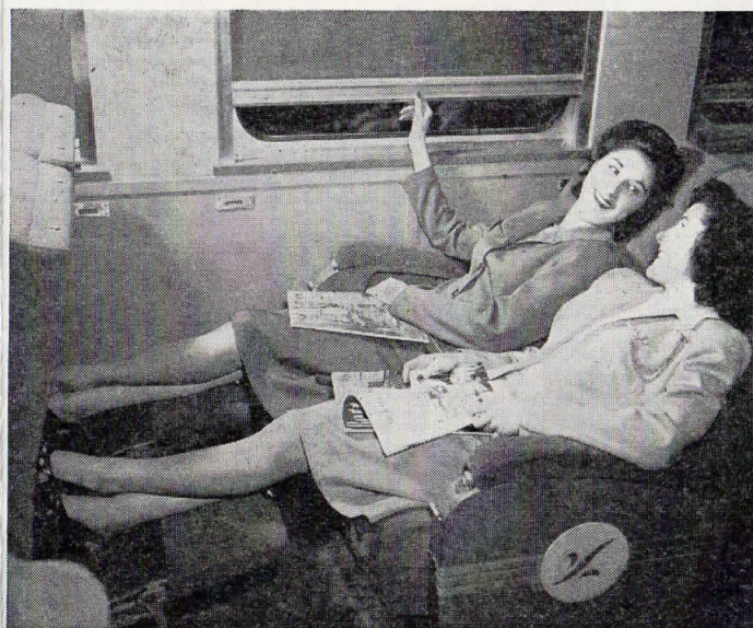
28 passengers can be accommodated in the coach section of the new buffet-lounge coach and 48 passengers in the other post-war coaches now in service on the North Coast Limited. These are the comfortable "Sleepy Hollow" seats with leg rest for reclining position.