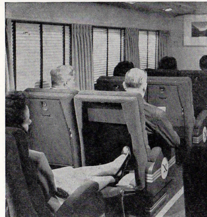
A leg rest adds to the travel ease of coach passengers on the Empire Builder, new Great Northern streamlined train.

S. P. & S. RY.—OREGON TRUNK RY.—OREGON ELECTRIC RY.—(Subsidiaries of Northern Pacific and Great Northern Railways)