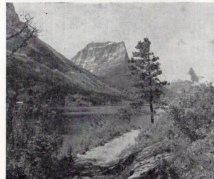
Upper end of St. Mary's Lake, Glacier National Park.—Great Northern Railway.

For the convenience of our patrons, the Spokane, Portland and Seattle Railway Company, in conjunction with other leading railroads, now offers three additional travel services as follows: