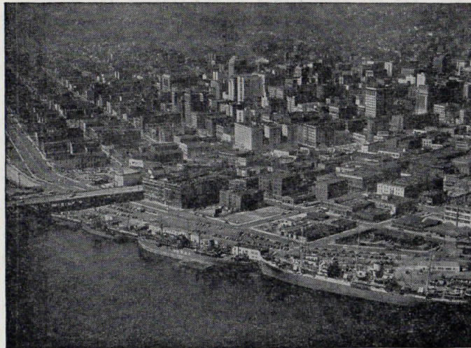
Portland—the Rose City

S. P. & S. RY.—OREGON TRUNK RY.—OREGON ELECTRIC RY.—(Subsidiaries of Great Northern and Northern Pacific Railways)