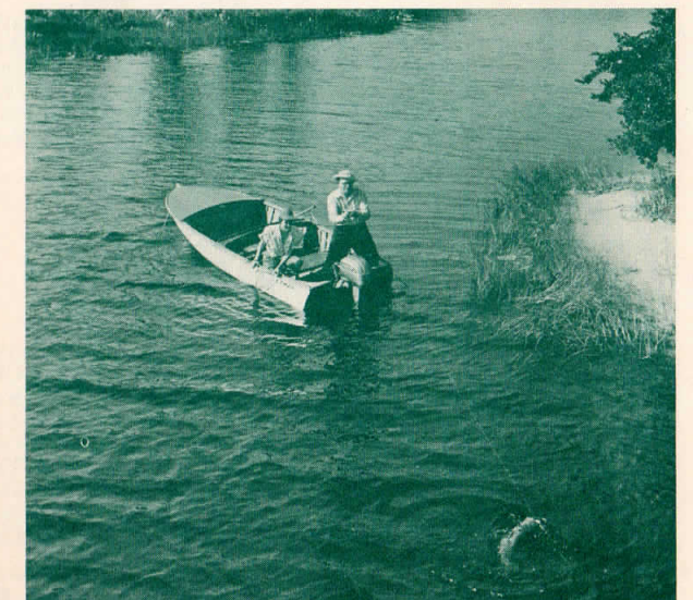
Typical Florida fresh-water fishing scene

REGULAR ROUTE COMMON CARRIER DAILY SCHEDULES