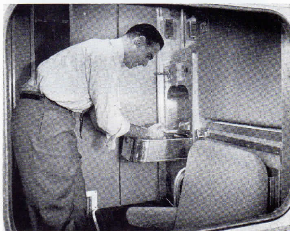
Your own private room with all facilities