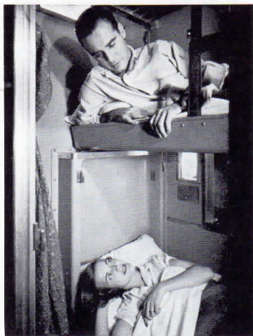
Double room — night

Since 1959, Northern Pacific patrons have enjoyed the comfort and economy of Slumbercoach service on the Vista-Dome North Coast Limited . The same service, still exclusive on this railroad in the Northwest, is now available on NP's second trans-continental train, The Mainstreeter . Private rooms, for both single and double occupancy, have their own comfortable beds, wash basins, toilet facilities, lights, air-conditioning and heat controls, and adequate luggage space. These accommodations may be purchased on coach tickets with savings of 20% or more from first class tickets and Standard Pullman fares . . . . For daytime occupancy only, low-cost seat charges are made — consult your local agent.