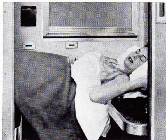
Single room — night

Convenient transfer arrangements have been made at St. Paul and Minneapolis for Slumbercoach patrons enroute to or from points east of the Twin Cities.