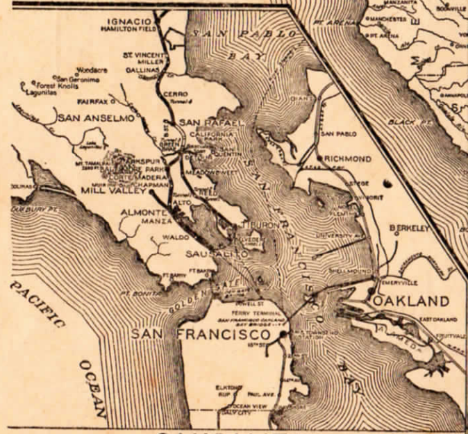
SAUSALITO AND ADJACENT TERRITORY SCALE IN MILES