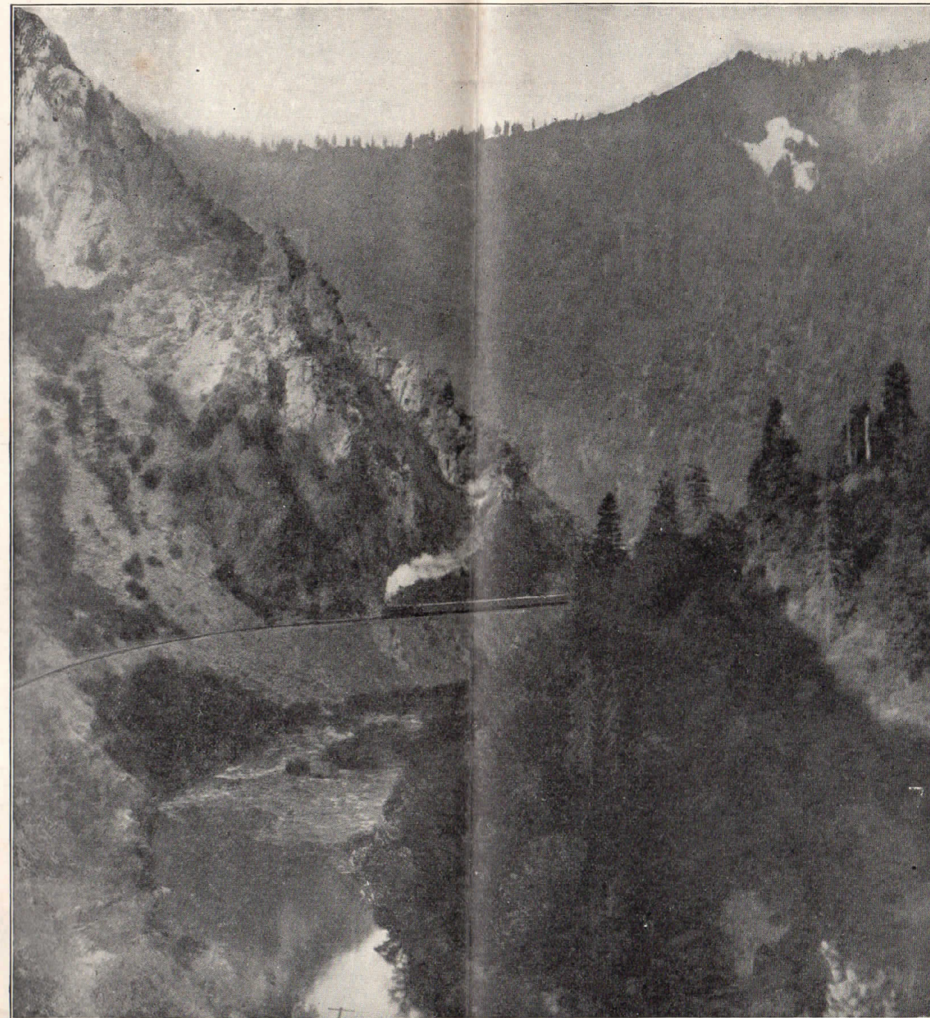
FEATHER RIVER CANYON, CALIFORNIA Over 100 Miles of Scenery Just Like This Western Pacific Railroad—Feather River Route