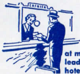
at many leading hotels