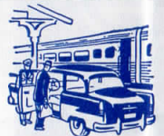
for car rental (Avis, Hertz, National)