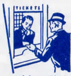
at ticket offices