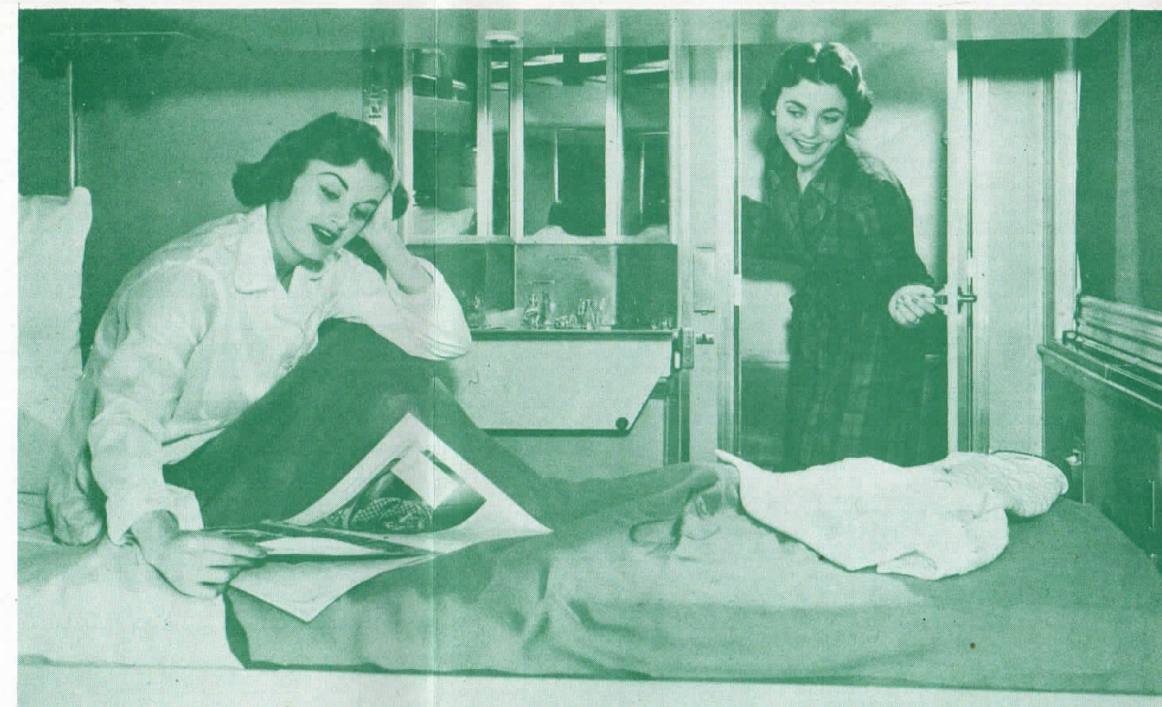
Here's your "Beauty Sleeper" Bedroom . . . a dream of cozy comfort by day or night

You'll applaud the NEW TYPE bedrooms, roomettes and sections. You'll thrill to the smoother, quieter ride . . . to sparkling new beauty . . . to comfort and convenience