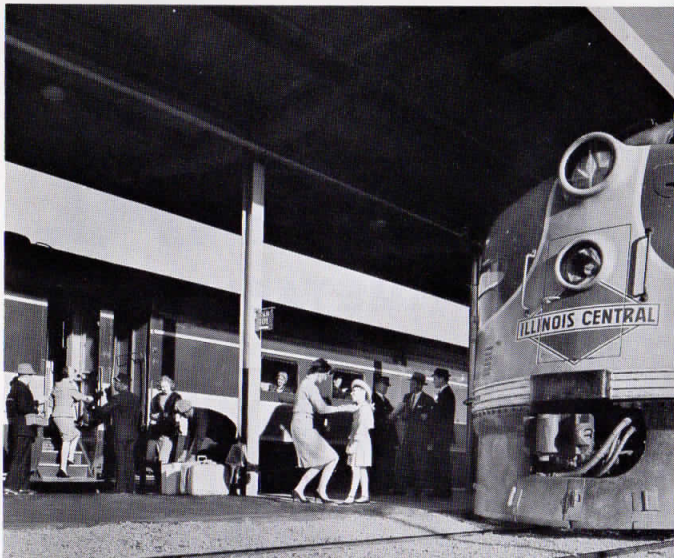
New Orleans passengers board the Panama Limited for the overnight trip to Chicago.