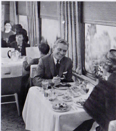
Well-prepared food and attentive service make dining a pleasure.

There's a special enjoyment generated by traveling aboard Illinois Central trains. You'll find complete relaxation, delicious meals and refreshments, pleasant conversation with fellow travelers.