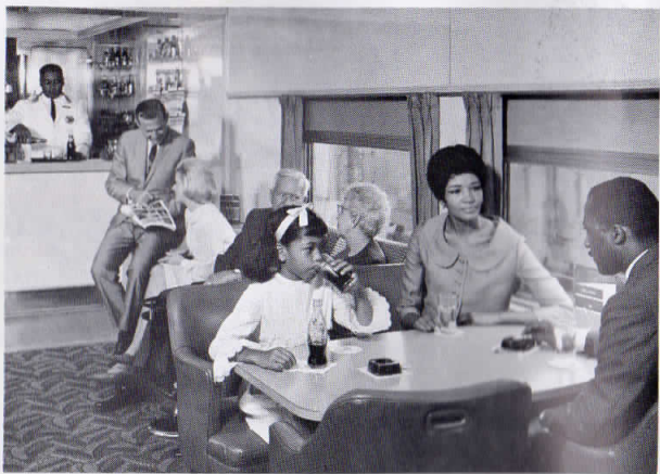
Spacious lounge cars are available to all passengers for refreshment and diversion.