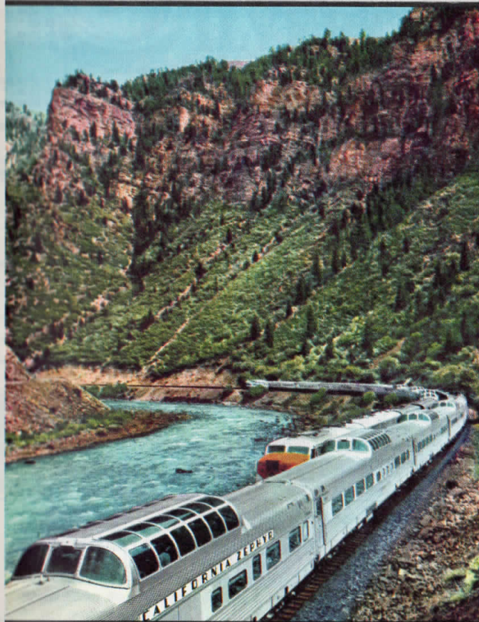
California Zephyr—Glenwood Canyon, Colorado River