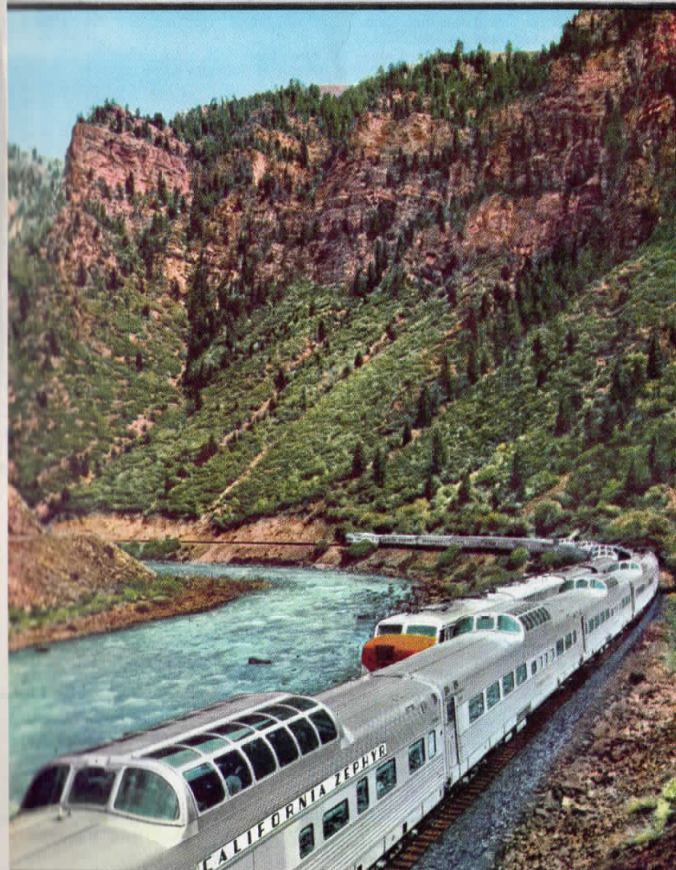
California Zephyr—Glenwood Canyon, Colorado River