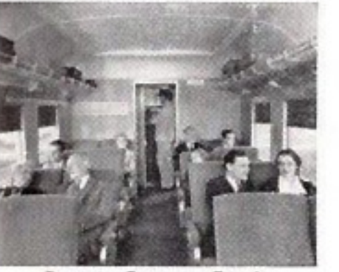
Luxury Lounge Coach