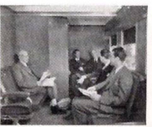
Men's Club-like Lounge Luxury Lounge Coach