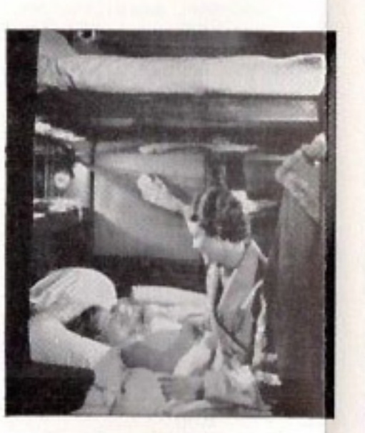
Comfort and Economy in Modern Tourist Sleeping Car