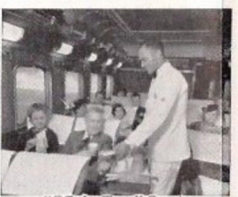
"Off-the-Tray" Service in Tourist Cars and Coaches