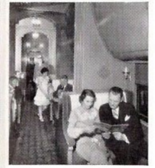
Pullman Standard Sleeping Cars