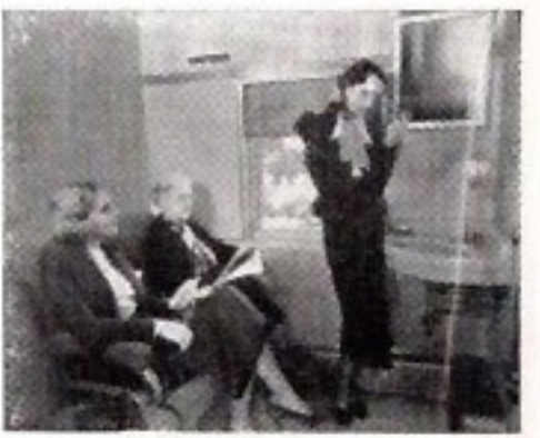
Women's Lounge Luxury Lounge Coach