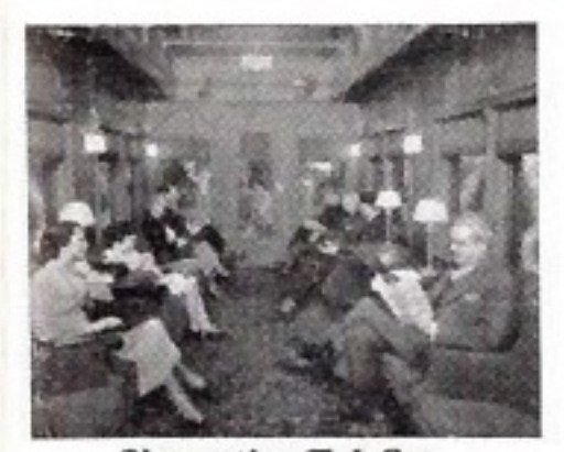
Observation Club Car

Connection during Yellowstone Park season only. Dark figures indicate p. m. Light figures indicate a. m.