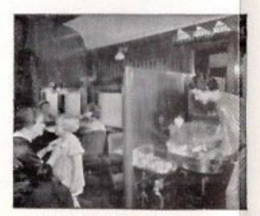
Women's Dressing Room, Tourist Sleeping Car